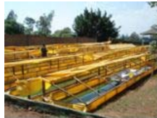
(Expansion of Spirulina basins from 180 m 2 to 450 m 2 , July/Aug 2009)