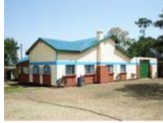
(Improvements made on the Od Mikayi, training centre and the office block, July/Aug 2009.)