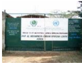
OD MIKAYI Training Facility