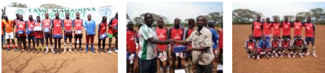
The coach Karapul F.C receives boots from CAMP MARADONA®