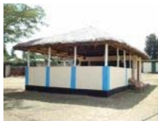
OFFICE BLOCK and Landscaping