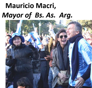
Mauricio Macri, Mayor of Bs. As. Arg.