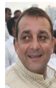
Sanjay Dutt INDIA