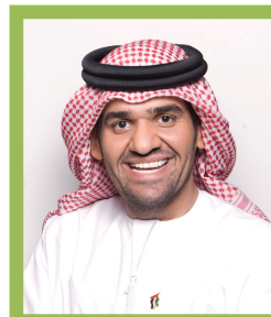
Hussain Al Jassmi U.A.E.