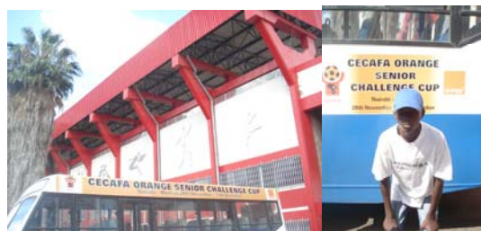
One of the young campMaradona® talents who attended the cecafa Games in Nairobi