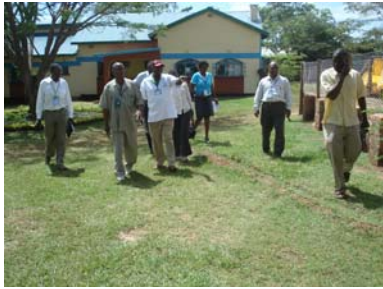
IIMSAM and visiting Kari Directors tour the centre