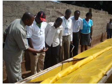
IIMSAM and visiting Kari Directors at the Spirulina farm

FEEDING PROGRAM: Despite the holiday season the feeding program continued and the numbers coming to the centre for feeding are still continuing to increase.